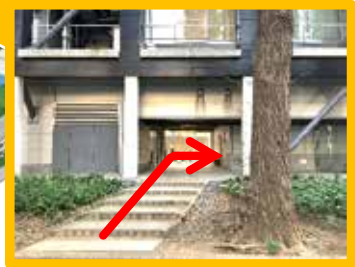
You can enter the entrance freely.

From “Midorigaoka” Station (Local trains stop ) walk 3 minutes 1. Go out of the ticket gate and turn left. Follow the brick-colored road along the station building. 2. If you go a little, there is a bicycle parking lot at the station under the elevated tracks, and continue as it is. 3. There is a Tokyo Tech gate in the middle of the bicycle parking lot. Immediately after entering the gate, it is a building surrounded by solar panels on the right side (along the track). 4. The entrance is located next to the monitor, in the middle of the building, on the side of the row of ginkgo trees.